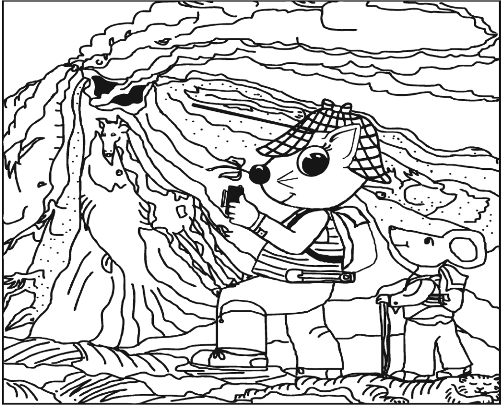
Mini Spy Classics appear in the first issue of each month.

Mini Spy and Alpha Mouse are hiking near a smoking volcano. See if you can find the hidden pictures. Then color the picture.