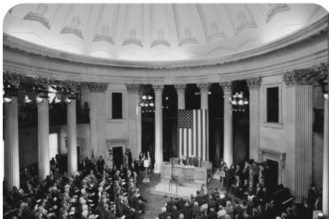
In 2002, a year after the tragedies on Sept. 11 in New York City; Arlington, Virginia; and Stonycreek Township, Pennsylvania; the U.S. Congress met in the rotunda at Federal Hall in remembrance.