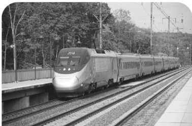
The Acela Express travels between Washington, D.C., and Boston. At its fastest, it travels at about 150 miles per hour.

• Intercity trains carry passengers longer distances, sometimes overnight. Overnight trains often have sleeping cars and dining cars.