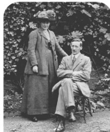
Beatrix Potter and William Heelis.

Potter died in 1943 at the age of 77. Because she was so interested in preserving nature, she left a lot of land for the Lake District National Park in England.