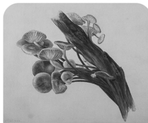
One of Beatrix Potter’s illustrations of fungi, or mushrooms.

The last one she wrote was “The Tale of Little Pig Robinson,” in 1930.