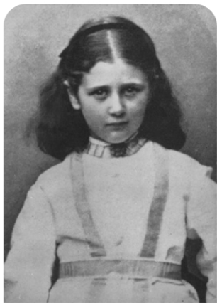
Beatrix Potter at age 9.

In 1905, she bought a farm there called Hill Top. Many of her books are set in this area.