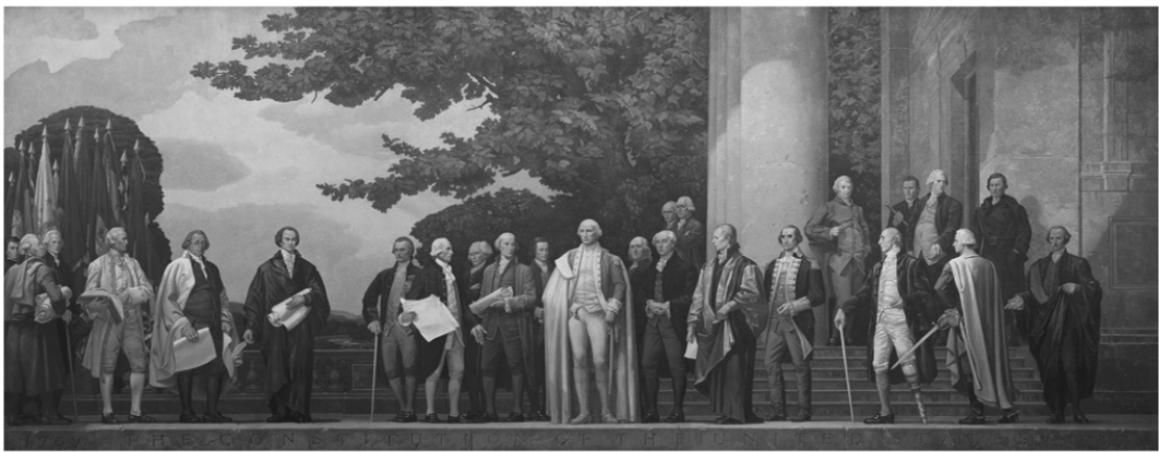
This mural of the Constitution’s signers hangs in the rotunda of the National Archives in Washington, D.C., near the original Constitution. It was painted by Barry Faulkner in 1936 and is almost 14 feet tall and 35 feet long.

Our Constitution’s birthday is Sept. 17. On that day in 1787, the delegates to the Constitutional Convention in Philadelphia signed the document that they had worked on for nearly four months.